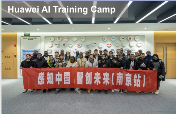
Huawei AI Training Camp