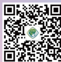
College of International Students,NUIST Wechat Search ID:cis-nuist