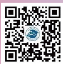
Website QR Code College of International Students,NUIST

2023 PROSPECTUS FOR INTERNATIONAL STUDENTS