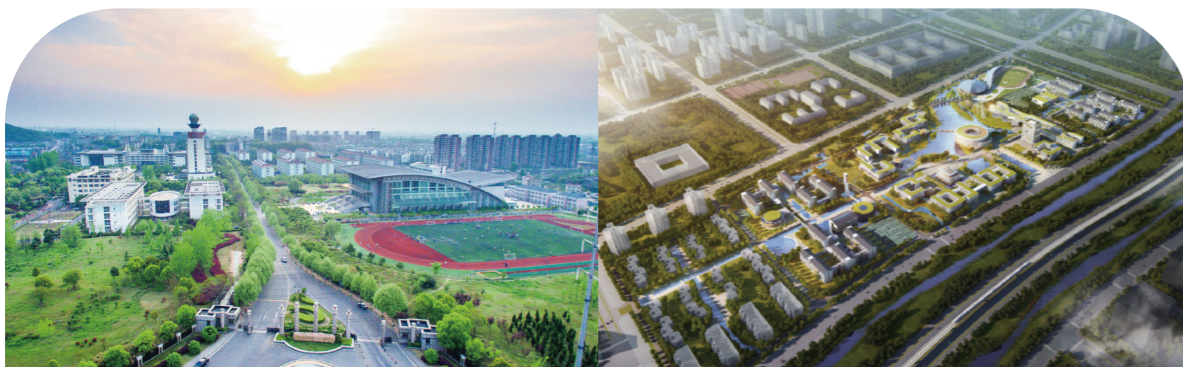
Main Campus, Nanjing City, Jiangsu Province