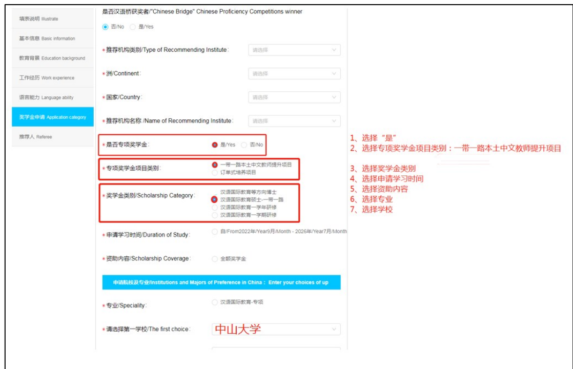
Figure.2 The International Chinese Language Teachers Scholarship application website - Scholarship - “Master’s program in Teaching Chinese to Speakers of Other Languages - BRI”